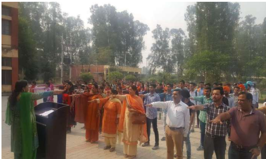
UNITY PLEDGE ON NATIONAL UNITY DAY

On October 31, 2018, NCC and the Department of Punjabi organized a pledge for national unity on Sardar Vallabhbhai Patel's birth anniversary celebrated as National Unity Day. Twenty-six students participated, affirming their commitment to unity and integrity. The event aimed to instill patriotism and commemorate Patel's contributions to India's unification. Through this joint initiative, students actively engaged in fostering a sense of national pride, echoing Patel's vision of a united and strong India.