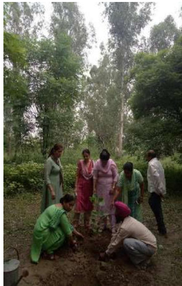
TREE PLANTATION U/ VAN MAHOTSAV