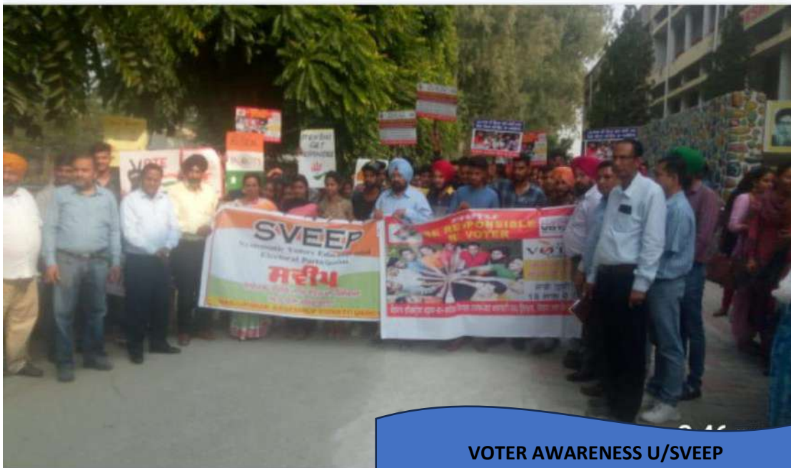
VOTER AWARENESS U/SVEEP

On October 30, 2018, a dynamic voter awareness campaign, comprising a rally and poster-making, was organized in collaboration with Municipal Committee, Tanda under SVEEP scheme. The event aimed to encourage people to take civic responsibility and stressed the importance of voting in a democratic society. Multiple organizations worked together, showing a shared dedication to educating the public and reinforcing democratic values in the community.